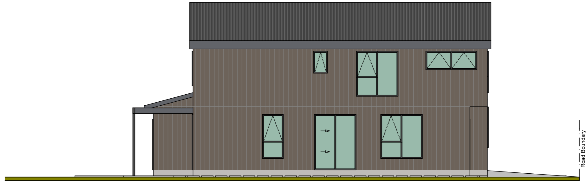
ELEVATION 2 SCALE 1 : 100