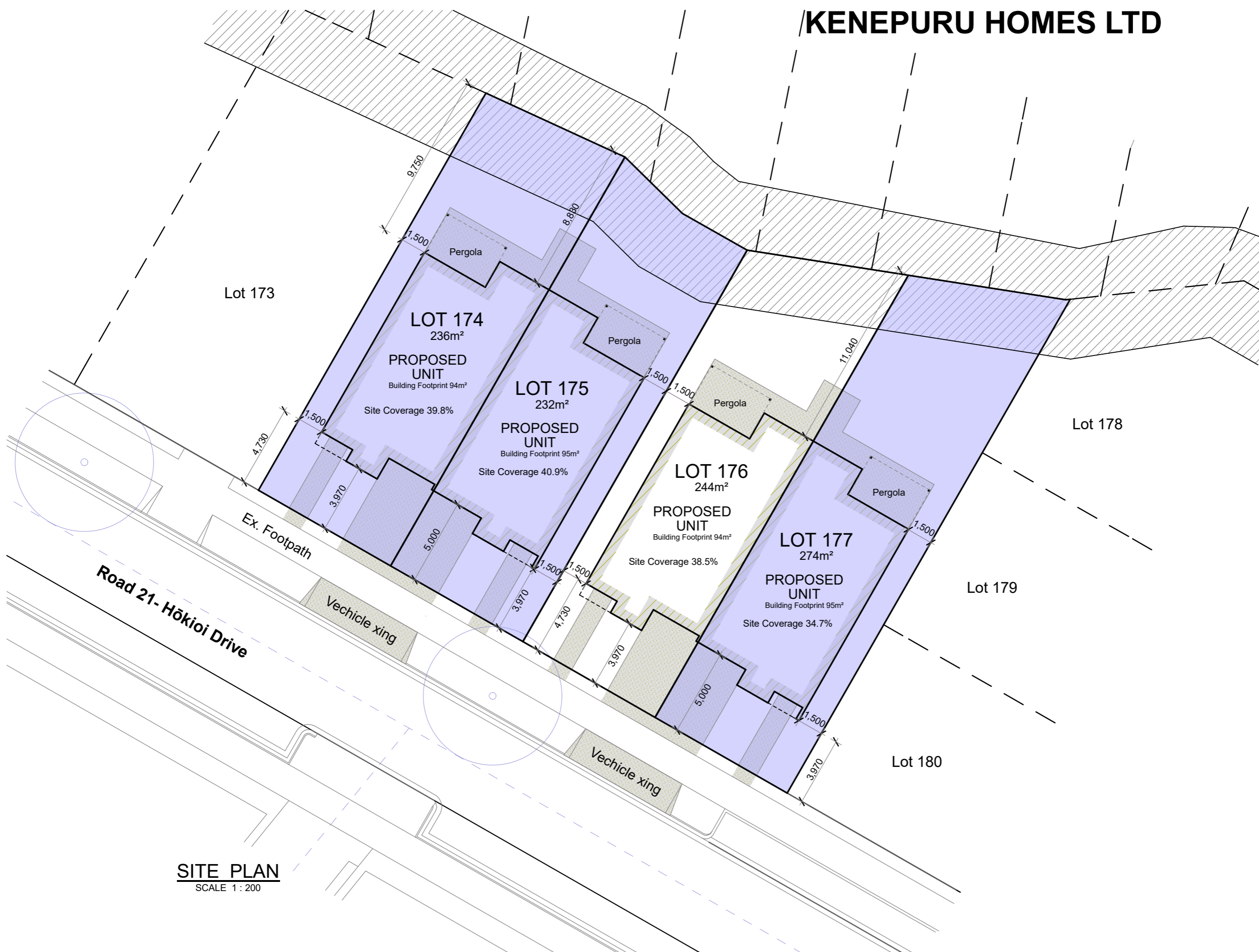
SITE PLAN SCALE 1 : 200