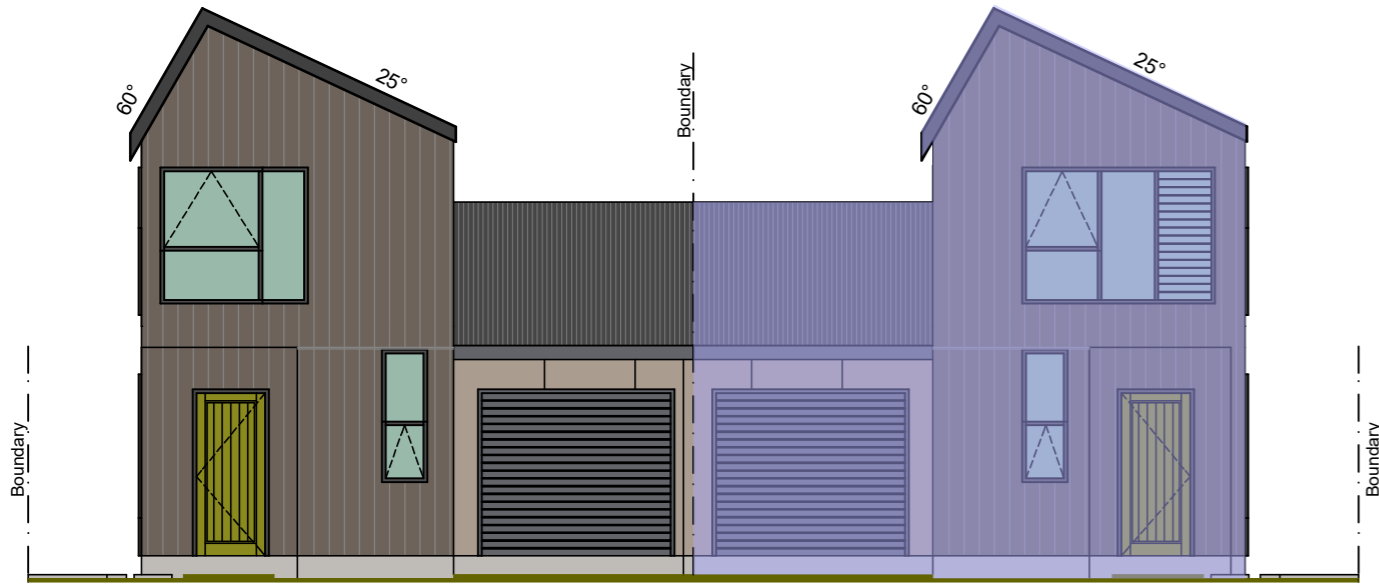
ELEVATION 1 SCALE 1 : 100