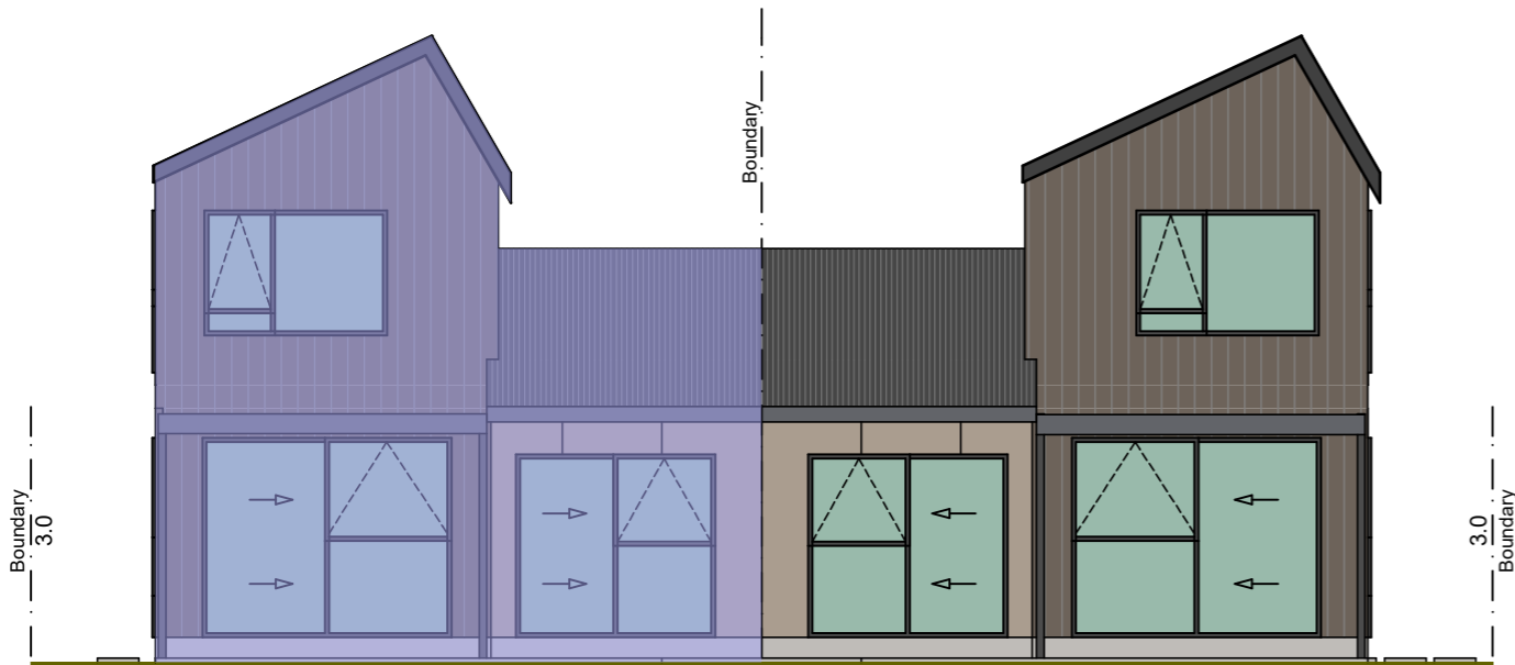
ELEVATION 3 SCALE 1 : 100